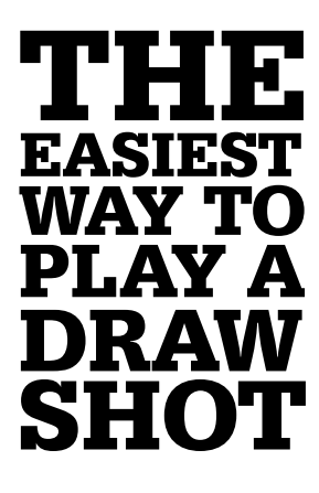
Align your clubface to where you want your ball to begin its flight, and align your body parallel to this.

Your address position has done all of the hard work for you, all you have to do from here is to swing normally in relation to how you have set your body up to your ball (aiming to the